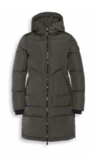
# 6230 DARK OLIVE