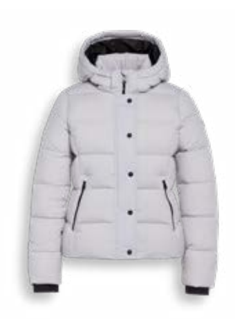
# 4910 LIGHT LILAC