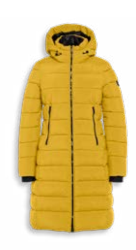
# 1100 YELLOW