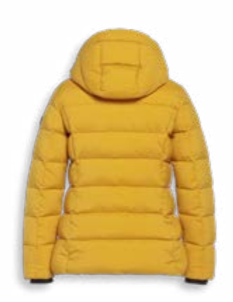
# 1100 YELLOW