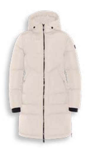
# 8100 EGGSHELL