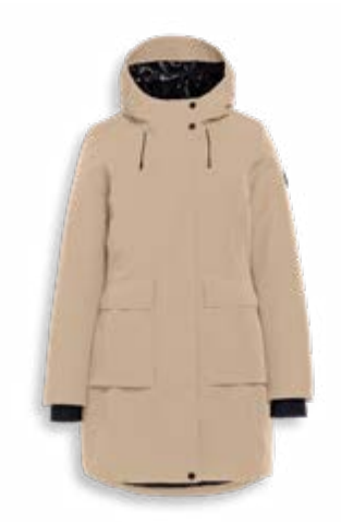
# 7150 LIGHT SAND