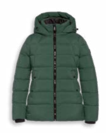
# 6160 TEAL