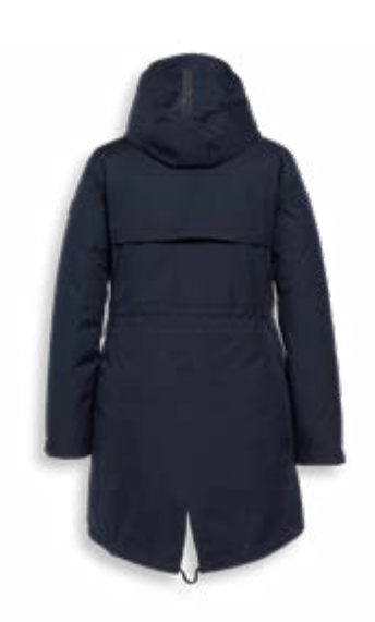
# 5070 MARINE