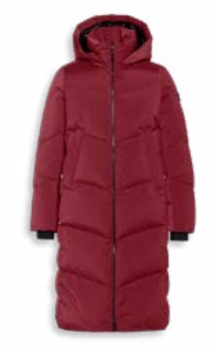
# 4015 RUBY RED