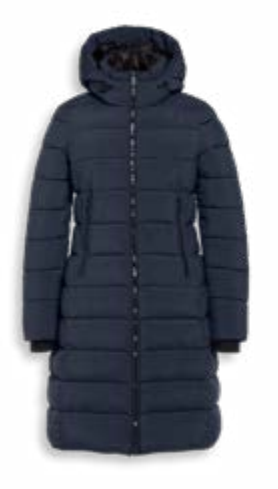
# 5060 NAVY