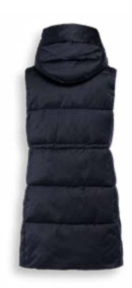
# 5070 MARINE