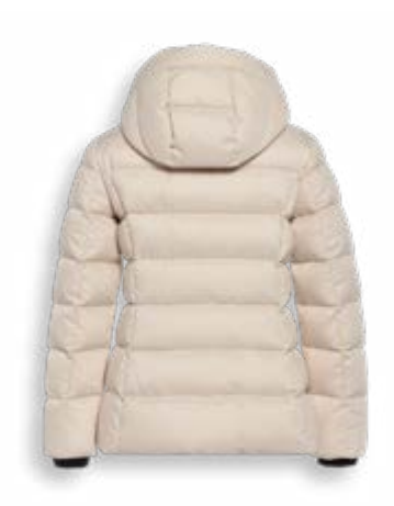
# 8100 EGGSHELL