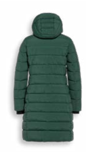
# 6160 TEAL