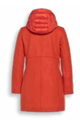
# 3000 ORANGE