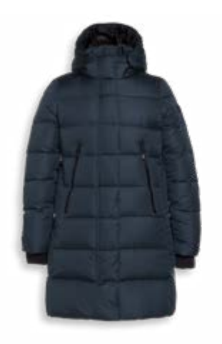
# 5500 PETROL