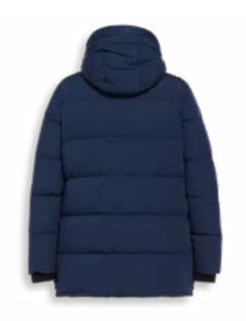
# 5070 MARINE