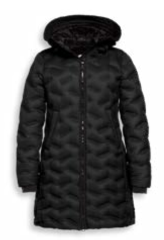
# 9000 BLACK