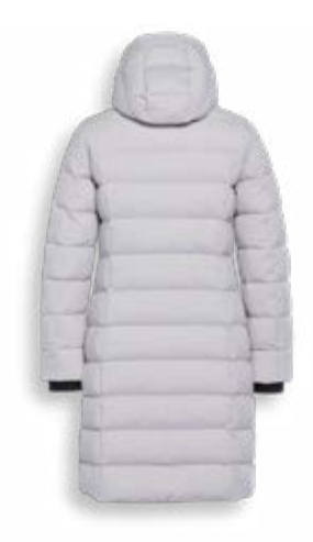
# 4910 LIGHT LILAC