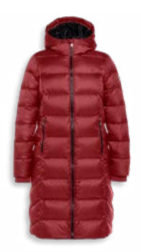
# 4015 RUBY RED