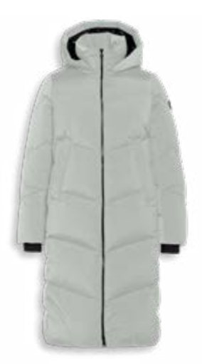
# 6045 COOL SAGE