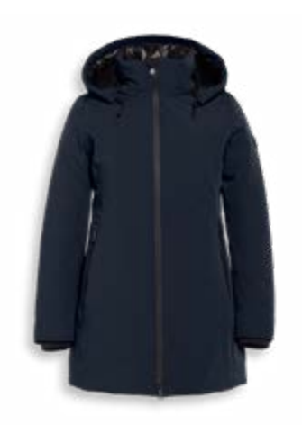
# 5070 MARINE