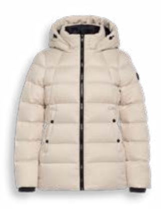
# 8100 EGGSHELL