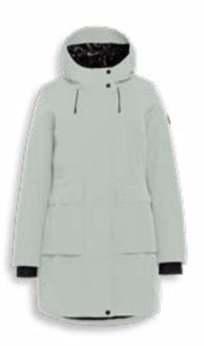
# 6045 COOL SAGE