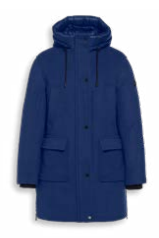
# 5150 IMPERIAL BLUE