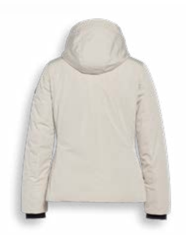
# 8100 EGGSHELL