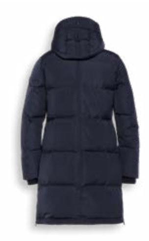
# 5070 MARINE