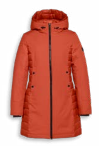
# 3000 ORANGE