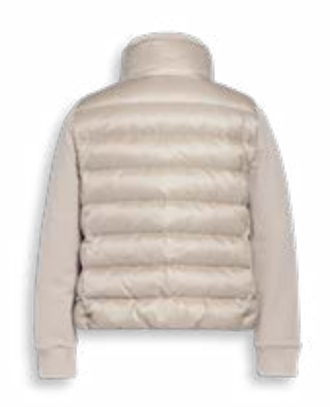
# 8100 EGGSHELL