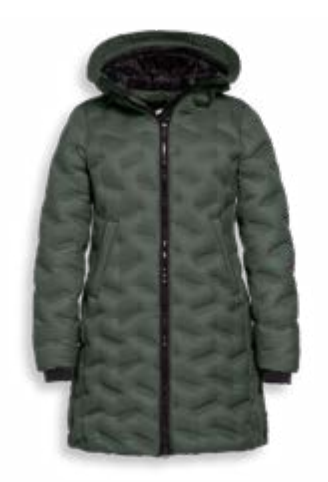
# 6040 SAGE