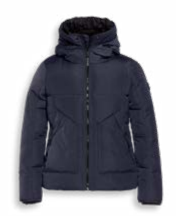
# 5070 MARINE