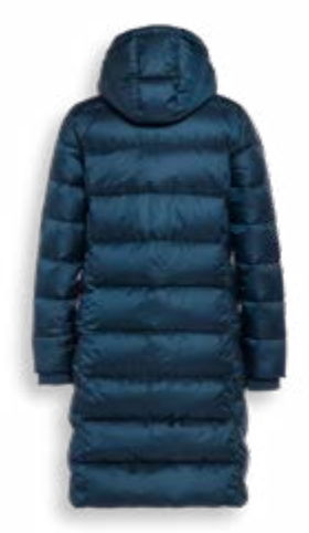
# 5500 PETROL