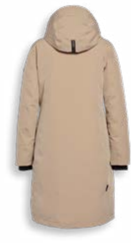
# 7150 LIGHT SAND