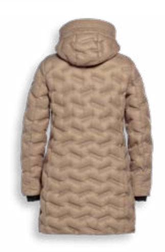
# 7150 LIGHT SAND