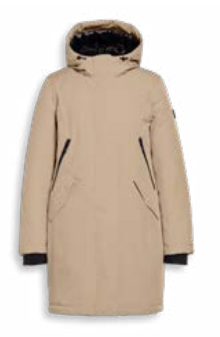
# 7150 LIGHT SAND