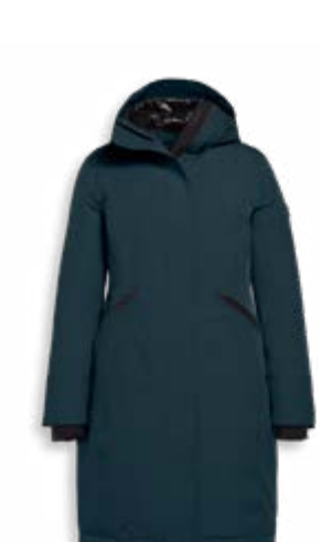
# 6045 COOL SAGE