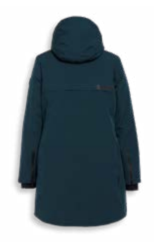
# 5500 PETROL