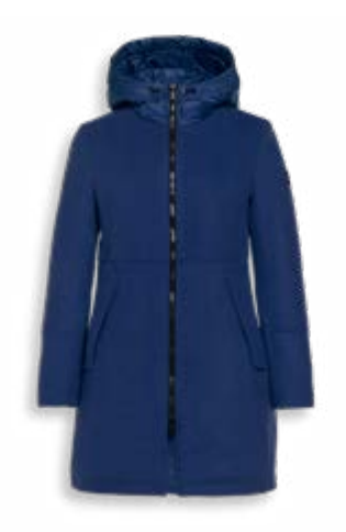
# 5150 IMPERIAL BLUE