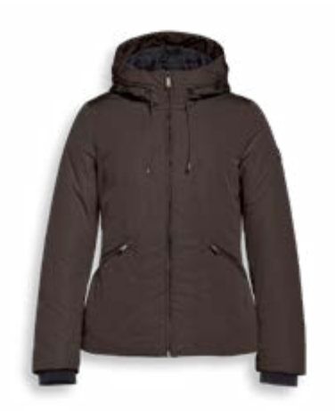
# 6210 DARK ARMY