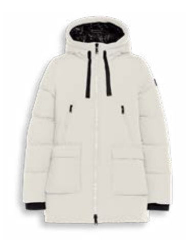
# 8100 EGGSHELL