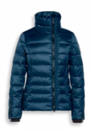
# 5500 PETROL