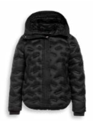
# 9000 BLACK