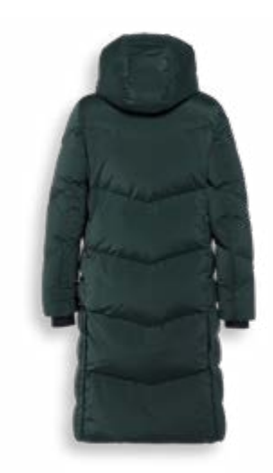
# 6160 TEAL