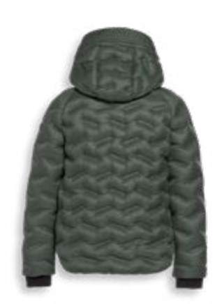
# 6040 SAGE