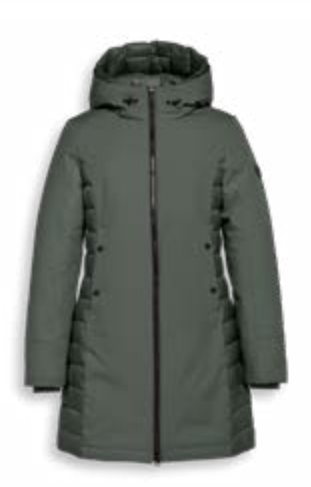
# 6040 SAGE