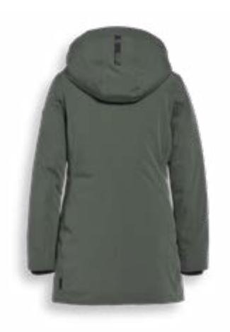
# 6040 SAGE