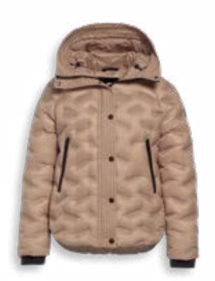
# 7150 LIGHT SAND