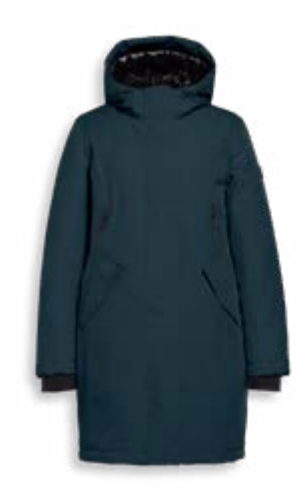
# 5500 PETROL