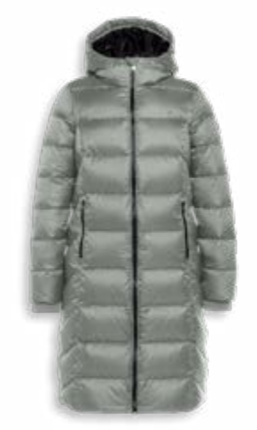
# 6040 SAGE