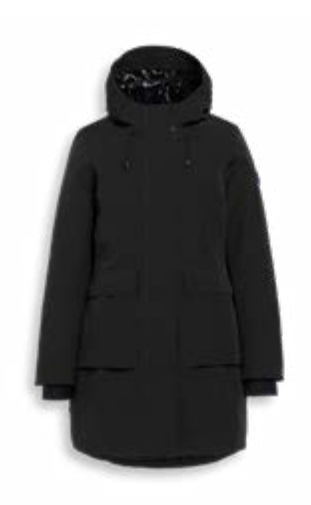
# 9000 BLACK