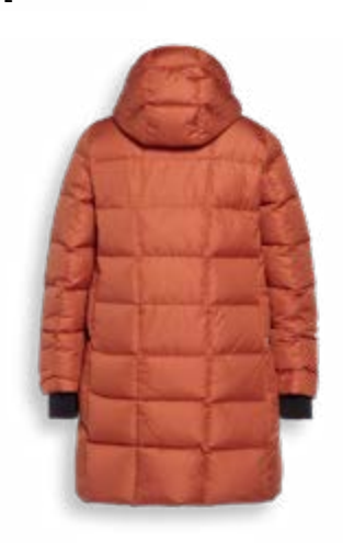
# 3000 ORANGE