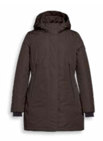
# 6210 DARK ARMY