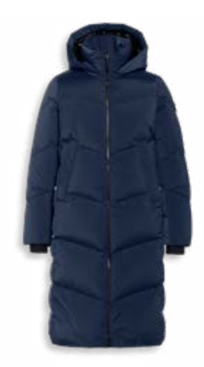
# 5070 MARINE