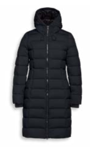
# 5060 NAVY