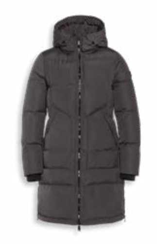
# 9180 GREY