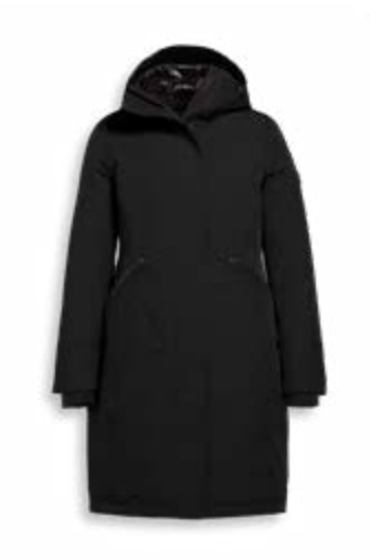
# 9000 BLACK