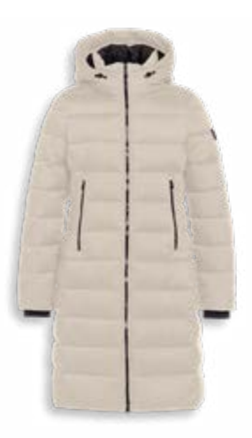
# 8100 EGGSHELL