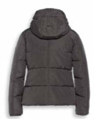
# 9180 GREY