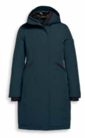
# 5500 PETROL