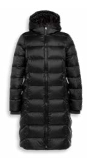
# 9000 BLACK