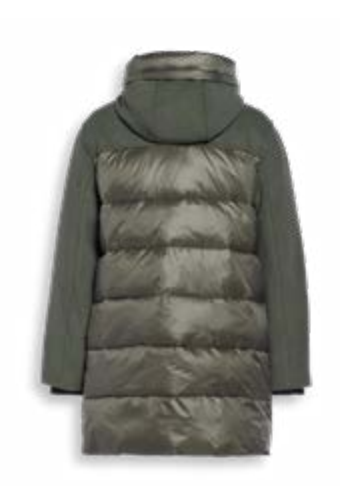
# 6040 SAGE