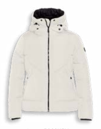
# 8100 EGGSHELL