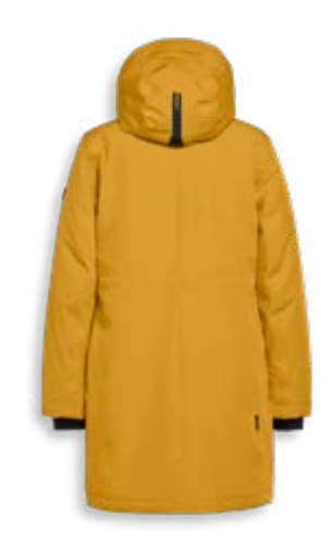
# 1100 YELLOW