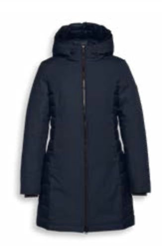
# 5070 MARINE