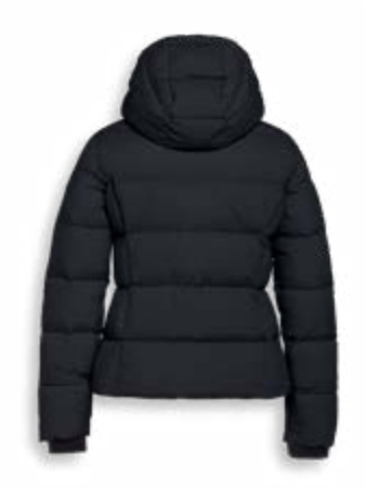
# 5060 NAVY