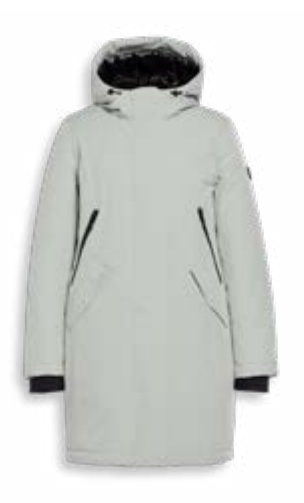
# 6045 COOL SAGE