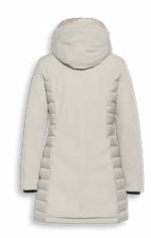
# 8100 EGGSHELL